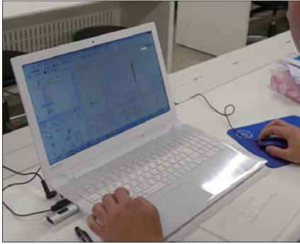
Picture 3: Each student is provided with a laptop for seminar demonstrations