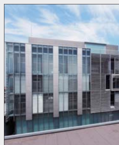
▲ Kanazawa-hakkei campus, Kanto Gakuin University (Kanagawa, Japan)