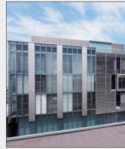
▲ Kanazawa-hakkei campus, Kanto Gakuin University (Kanagawa, Japan)